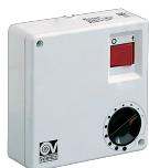
C 2.5 (COMANDO EL. 2.5 A)