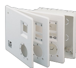
KIT SCB (TRASF.E.C.)